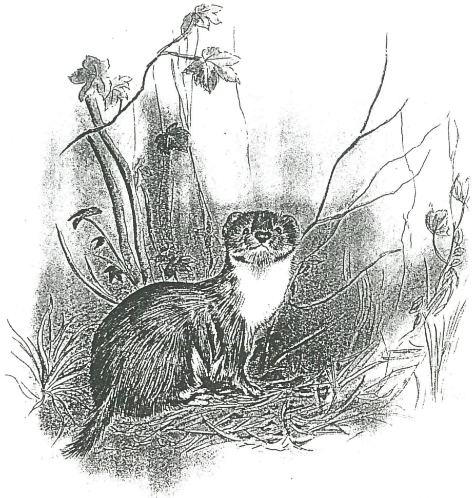
Weasel on the alert for food.